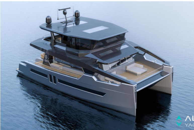
Alva Ocean Eco 60 Explorer