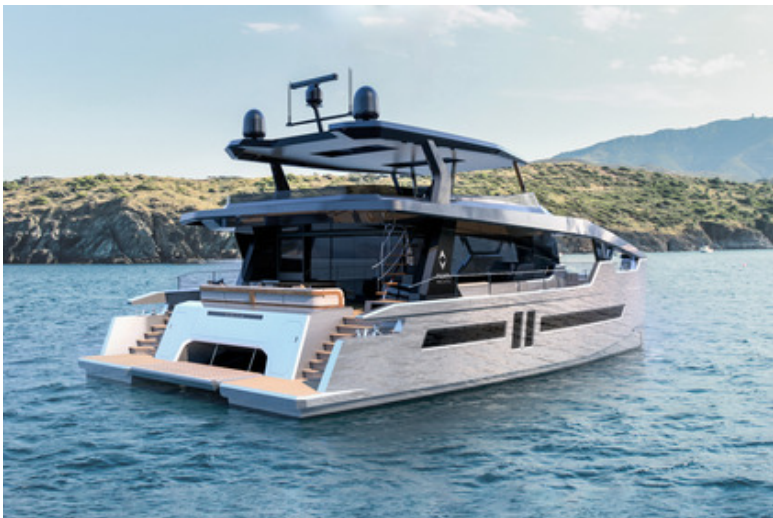
Alva Ocean Eco 60