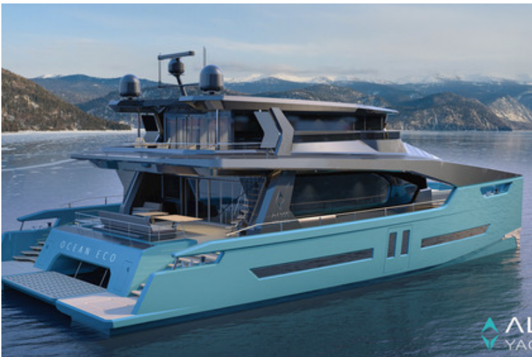
Alva Ocean Eco 90 Explorer